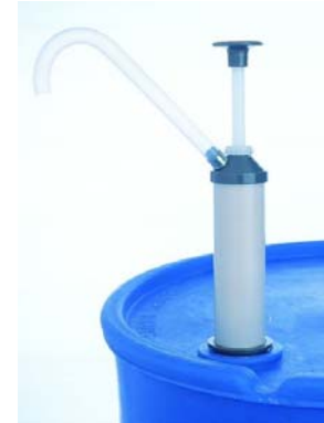
Figure 5 - Hand pumps