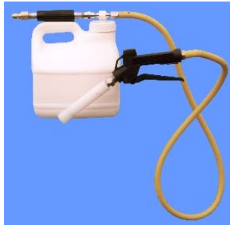
Figure 4 - Bottle dispensers and foamers