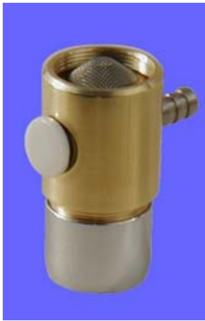
Figure 3 - Faucet mounted proportioners

Below are some examples of non-1055 systems: