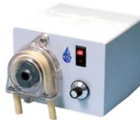
Figure 7 - Peristaltic pumps