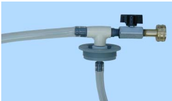
Figure 6 - Drum-mounted proportioners